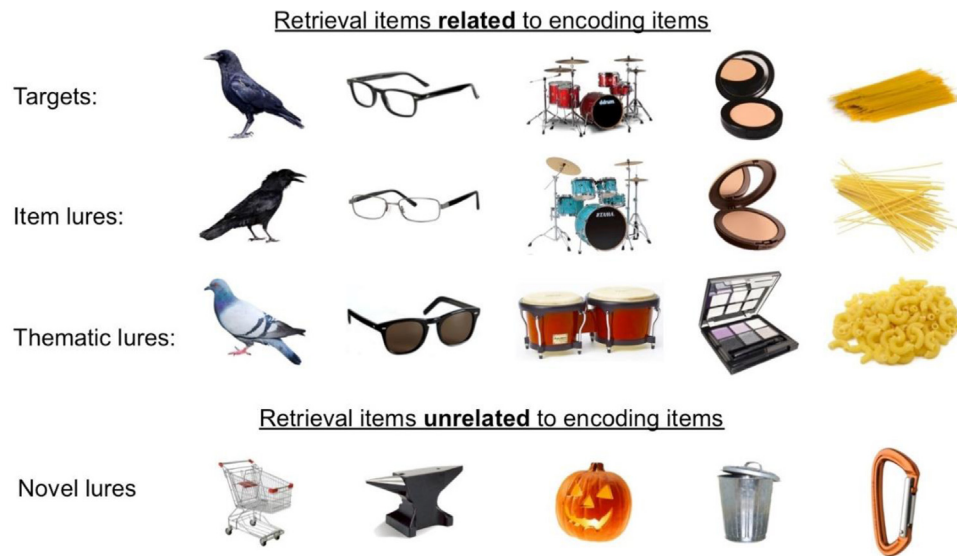
Fig. 1. Example stimuli. Participants viewed objects during encoding while making size judgments. During retrieval, participants viewed objects that were targets (the same object viewed during encoding), item lures (perceptually related objects), thematic lures (object from the same category), and novel lures (completely unrelated objects). Figure reproduced from Bowman et al., 2019.

then prescribed at an oblique angle that prevented data collection in the area of the orbits. A high-resolution anatomic image was acquired in the sagittal plane using a magnetization prepared rapid gradient echo sequence with a 1650-msec repetition time, 2.03-msec echo time, 256-mm field of view, 256-mm 2 matrix, 160 sagittal slices, and 1-mm slice thickness for each participant. Echo-planar functional images were acquired using a descending acquisition, 2500-msec repetition time, 25-msec echo time, 240-mm field of view, an 80-mm 2 matrix, and 42 axial slices with 3-mm slice thickness, resulting in 3-mm isotropic voxels. Ninety-one volumes were collected in each of 2 functional runs of the encoding task. One hundred seventy-five volumes were collected in each of the 4 functional runs of the retrieval task. Specifically, the acquisition angle was set to ensure full coverage of the temporal pole and medial temporal regions and sufficient signal-to-noise ratio (SNR) during functional imaging acquisition. Age differences in functional signal-to-fluctuation-noise-ratio (SFNR) are reported per region of interest in supplementary table 4.